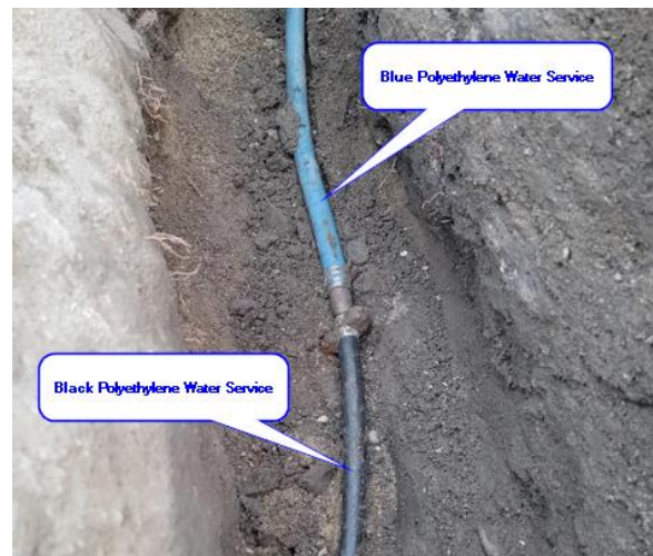
Black and Blue HDPE