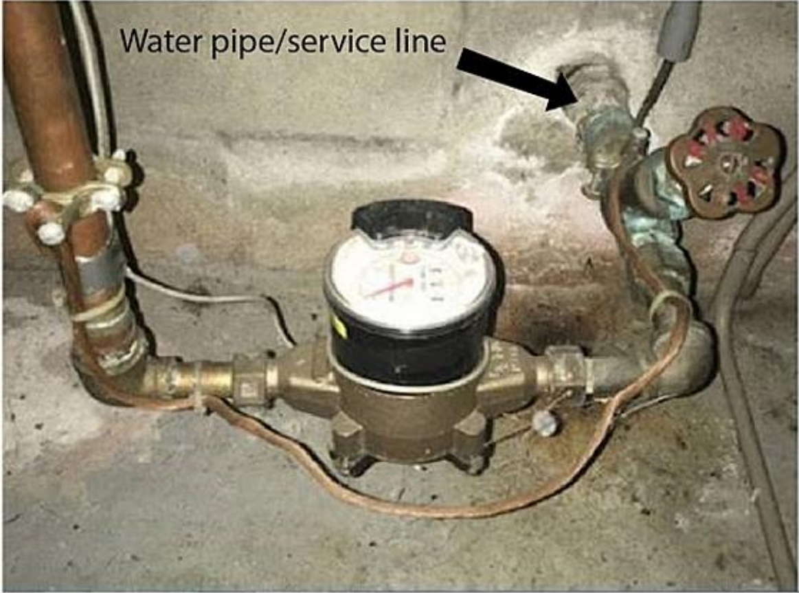
Water pipe/service line